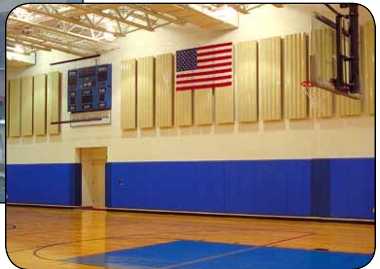
KNP, V-Groove Panel

Functional and aesthetically pleasing, the Kinetics' KNP panel is ideal for controlling reverberant noise problems in gymnasiums, natatoriums, and recreation centers.