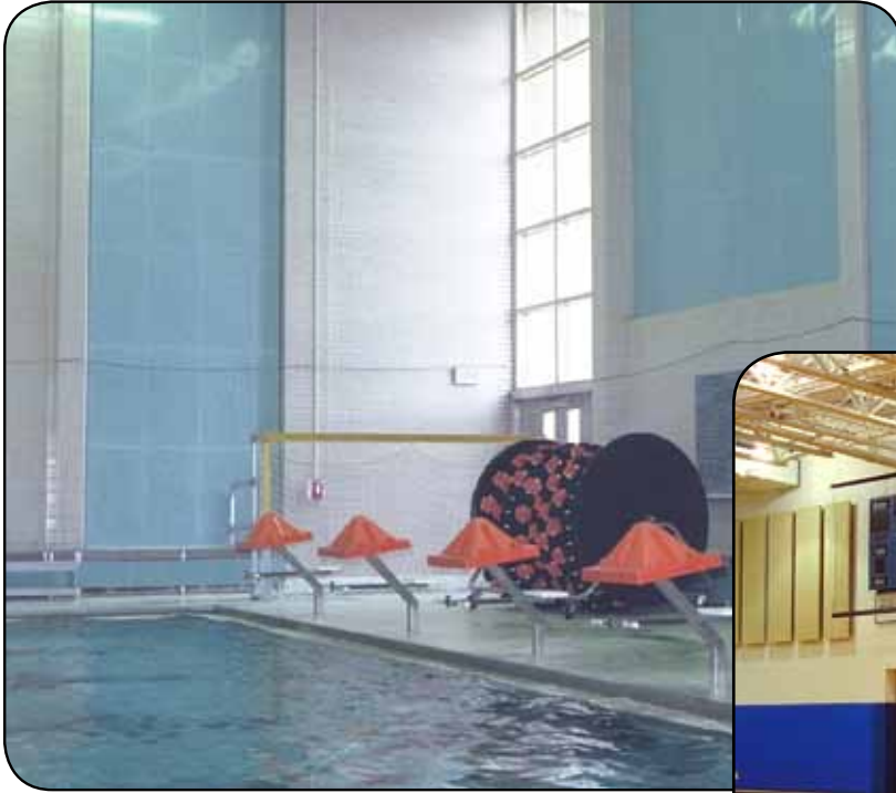
KNP, Flat Panel