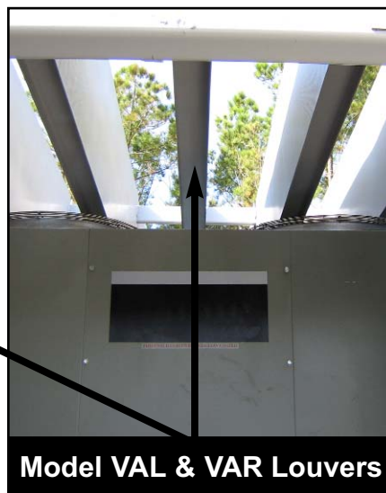
Model VAL & VAR Louvers