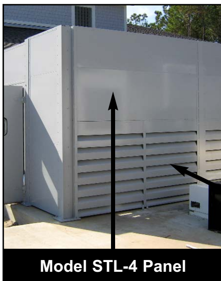
Model STL-4 Panel

Outdoor Air-Cooled Chiller Acoustical Barrier Wall System