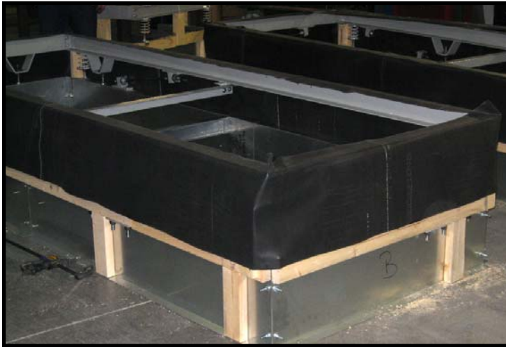
Assembled curb with EPDM weatherseal attached