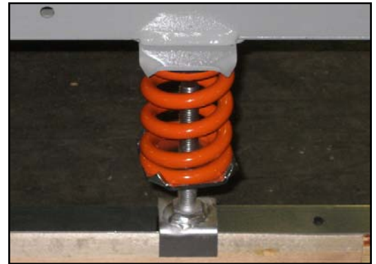
Adjustable and Interchangeable Spring Coils