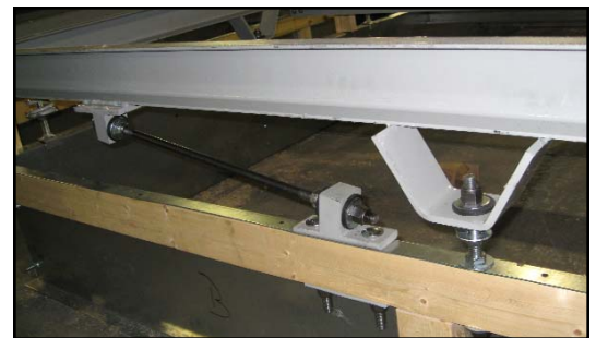
Vertical and Horizontal Seismic/Wind Restraints. Meets the current IBC Building Codes