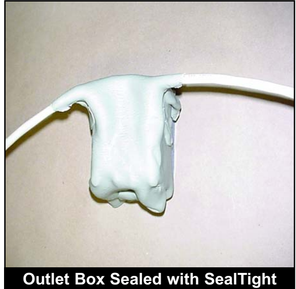
Outlet Box Sealed with SealTight